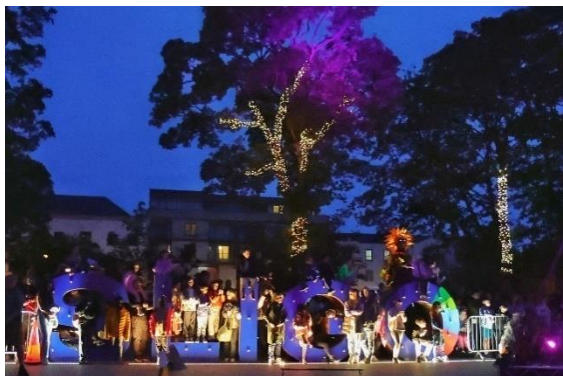
Cairde Arts Festival July 2024