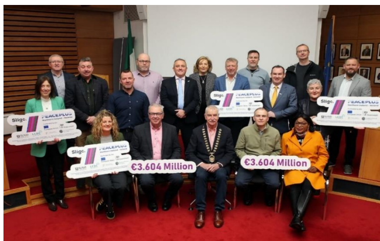
Members of the Sligo PEACEPLUS Partnership

The Sligo Programme was developed after extensive consultation using the co-design process to address needs within the Sligo County Council area. This resulted in the development of 15 projects across the thematic areas comprising of 4 capital investment projects, 8 capacity-building initiatives and 3 cultural and social inclusion programmes. These projects support peaceful and thriving communities and seek to enhance community integration and cohesion within the three themes.