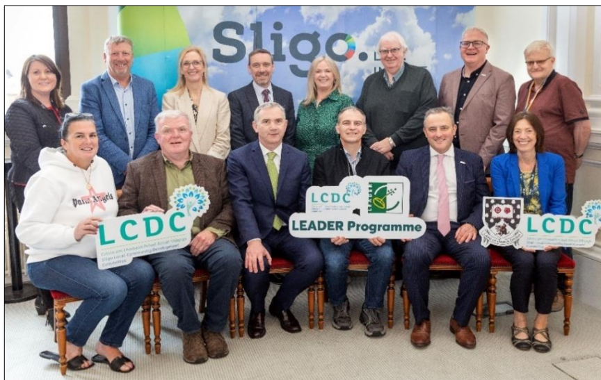
Members of Sligo LCDC, Sligo LEADER Partnership, LCDC Support Staff marking the commencement of the new Programme

The commencement of the new LEADER Programme 2023-2027 was marked at City Hall, Quay Street, Sligo on Thursday 30th May 2024 with members of the LCDC, staff of Sligo County Council and Sligo LEADER Partnership attending. Sligo's LEADER Programme 2023-2027 is open to accept 'Expressions of Interests'. Community groups, private individuals and new or existing businesses are invited to find out more about Sligo LEADER Programme 2023-2027 funding and its application process.