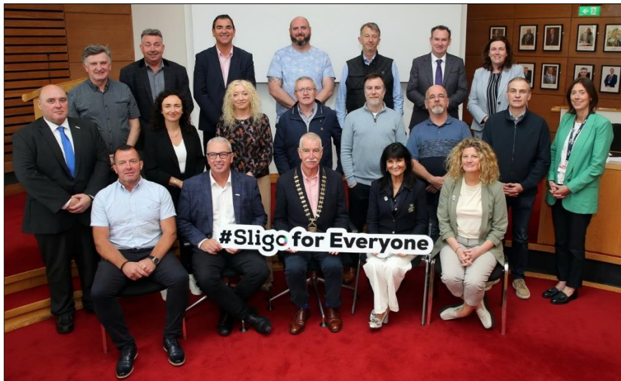
Members and staff of Sligo County Council at the release of "Sligo for Everyone"