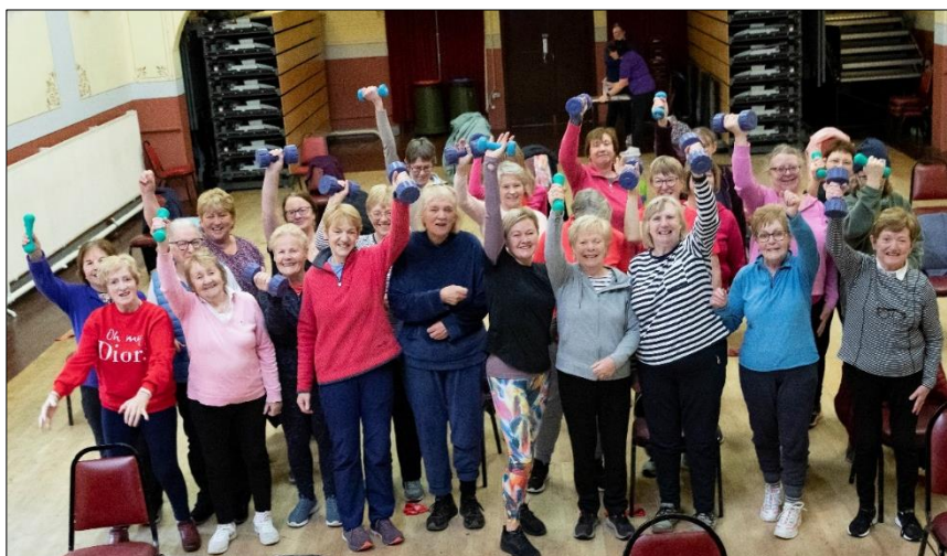
Participants on the Stronger for Longer Programme, Tubbercurry.

In the Healthy Sligo consultation process the need to develop a holistic approach to wellbeing and nutrition was highlighted. As a result, and in collaboration with a nutritionist and mindfulness facilitators a holistic approach to health and wellbeing has been developed, providing additional optional workshops for all participants throughout each term. This holistic collaboration has enhanced and increased the numbers participating in the programme with a reach of two hundred people. This is the first time this collaborative approach to increasing physical activity alongside nutrition and mindfulness has occurred and is bespoke to Sligo.