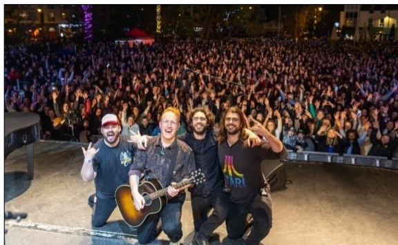
Queen Maeve Festival 'Gavin James' May 2024