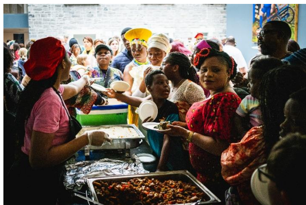
Photo shows participants at the Sligo Africa Day Celebrations 2024