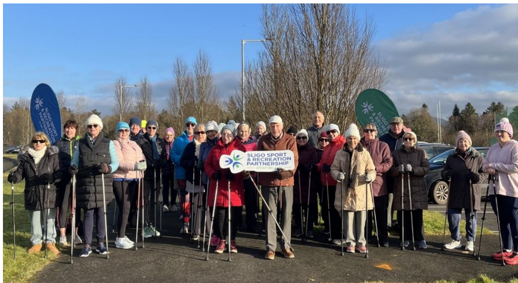
Participants in the Activator Poles programme in Doorly Park